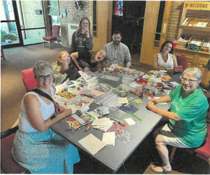
Making Cards for Caring in Action Team (CIA)