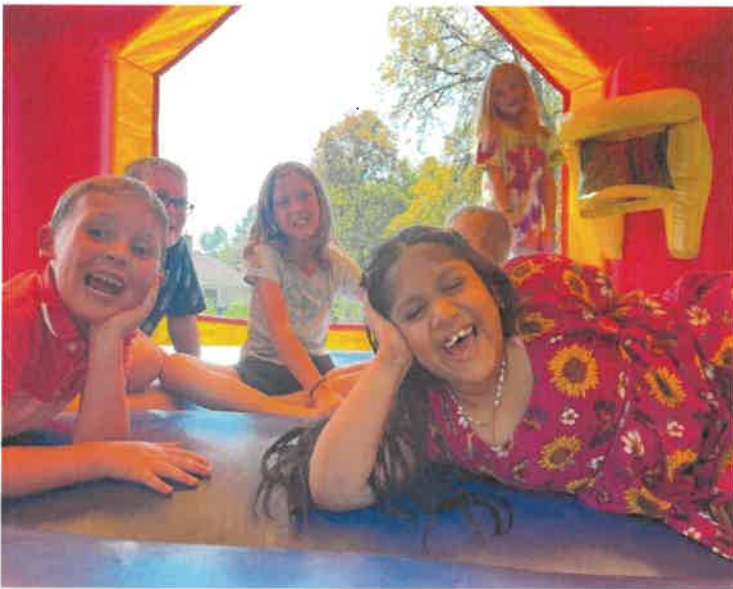
Our kids having FUN, together!