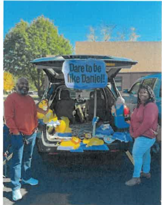
Welcome to the Rapaka Family's Trunk!